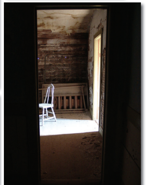
Clockwise at top left: "McCormick Mini-Mart." "Father Winter." "Ghost Chair." "Abstract Ice." "Synapse."